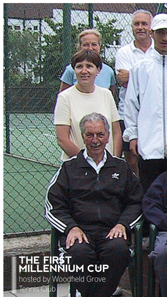
THE FIRST MILLENNIUM CUP hosted by Woodfield Grove Tennis Club